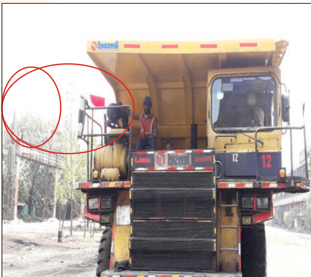
All the Haulpaks are equipped with rear view Mirrors on both sides for clear visibility