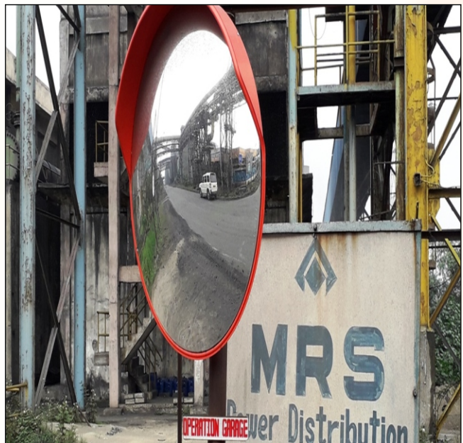
Installation of Blind Corner Convex Mirrors at vulnerable locations