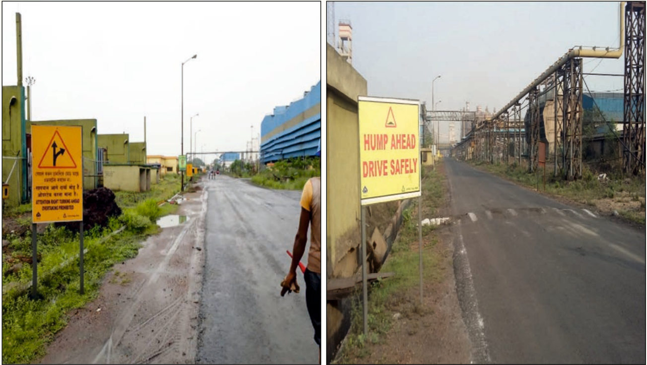
Display of safety poster across road area outside Mills