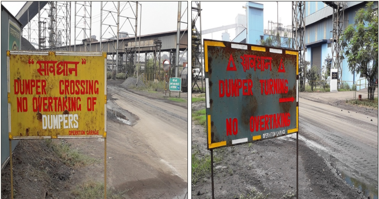
Retro-reflective signage are placed at vulnerable locations to caution commuters.