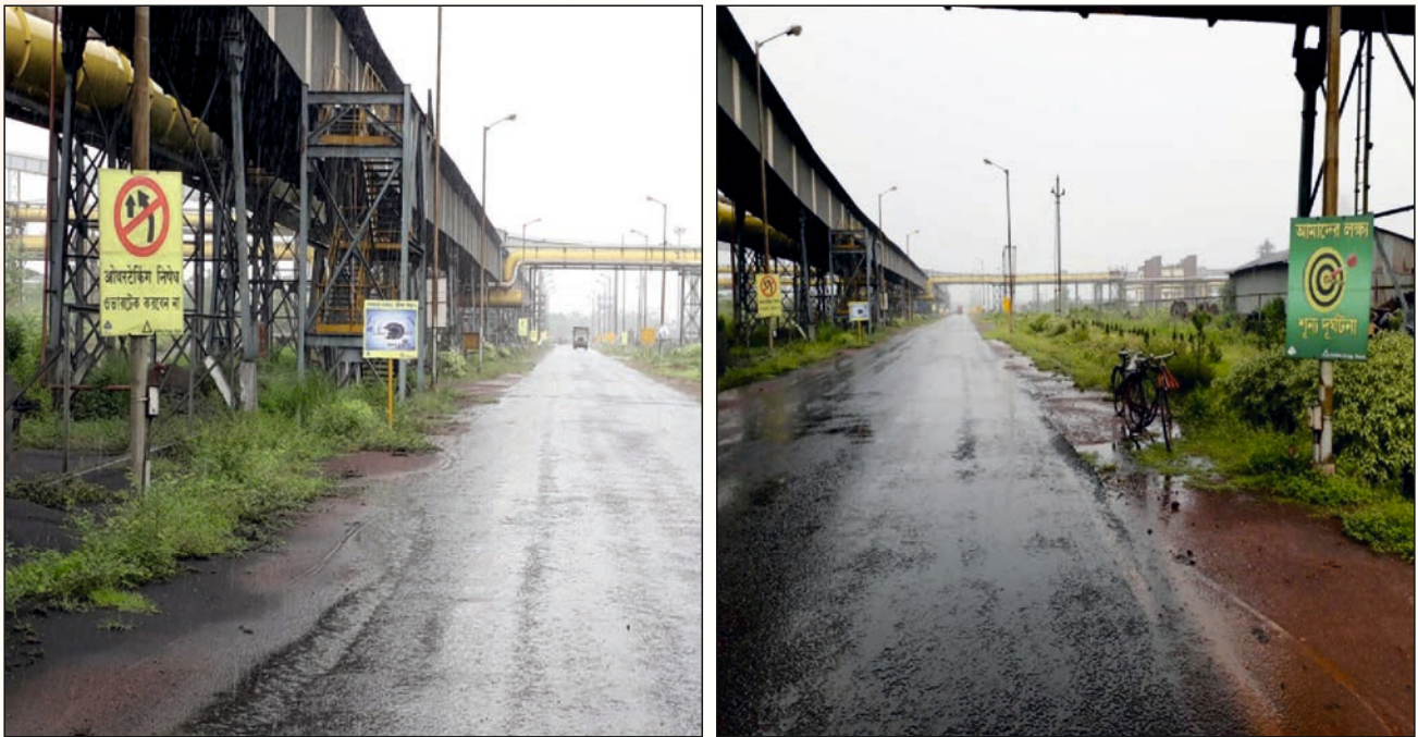
Display of safety poster across road near PBS Crossing