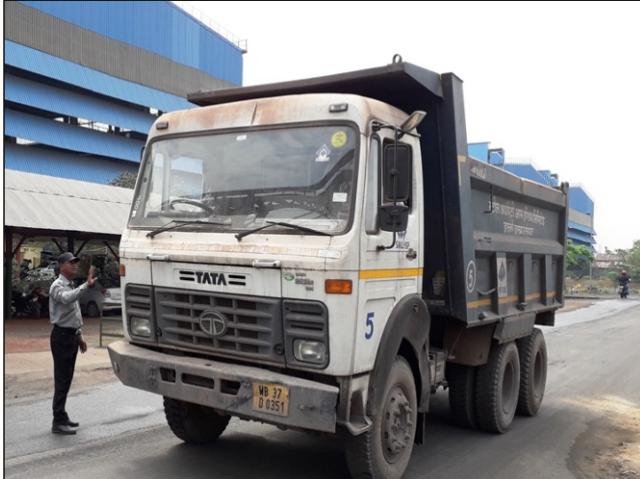
Traffic management by Traffic Assistant