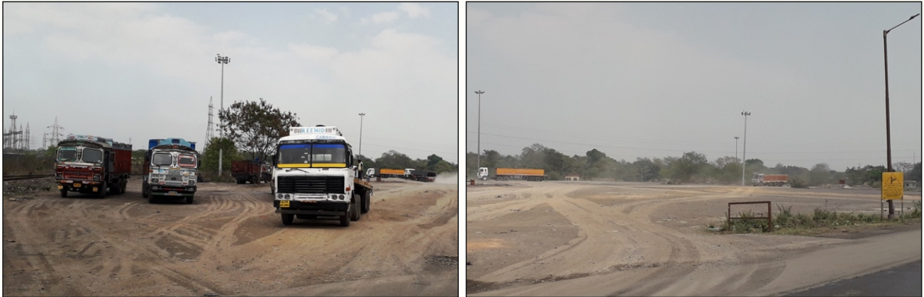
Designated Parking space has been earmarked in front of Mills for heavy vehicles/ trailers for Road dispatch of finished products.