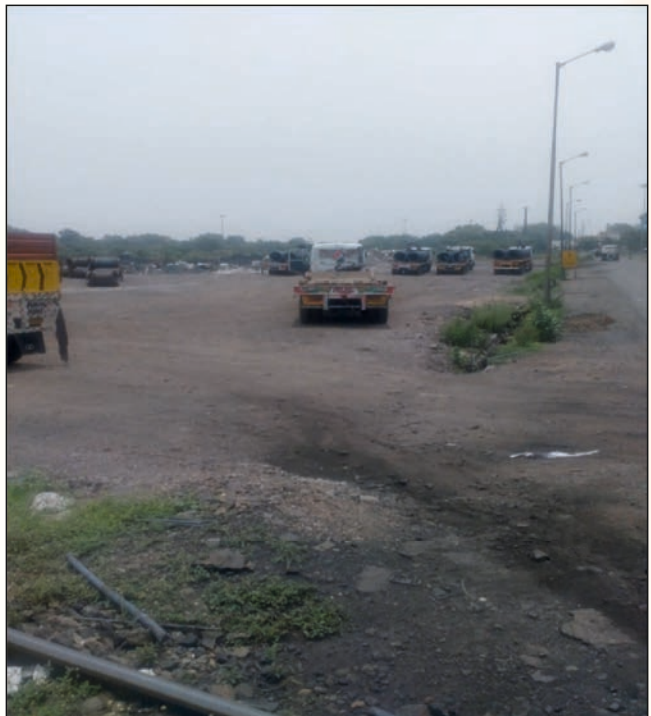
Separate area has been developed for parking of dispatch vehicles.