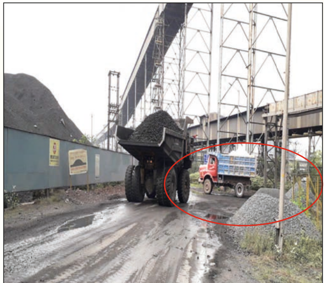
All the Haulpaks are equipped with side indicators/turning indicators along with Hooters for audio-visual alarm while turning