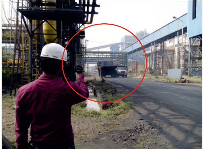
Dumper speed checking by speed gun