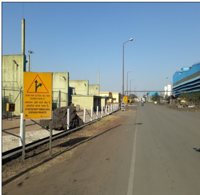
Retro-reflective signages are placed at vulnerable locations