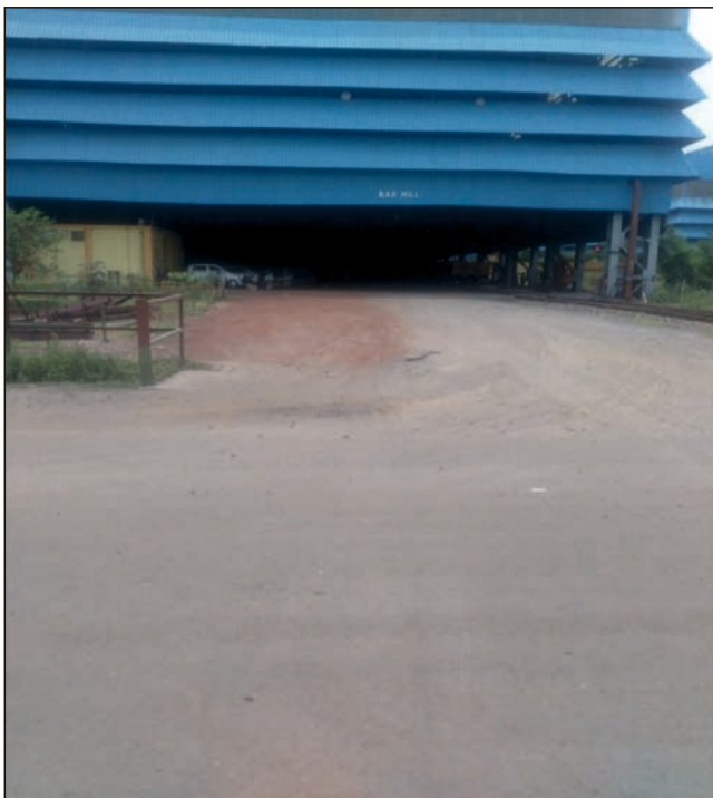
Road has been widened at the entrance to Bar Mill area